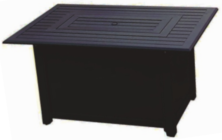
GI-FP341BK Rectangle Firepit Size: 46" L x 31" W x 24.5" H