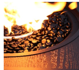
Black Firebeads included