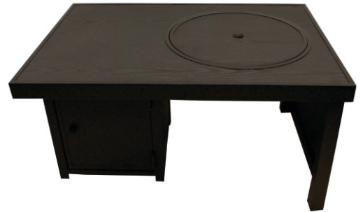
GI-FP343BK Offset Firepit Size: 42" L x 29" W x 20.5" H