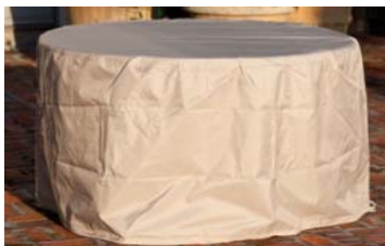
Water-Resistant Cover included