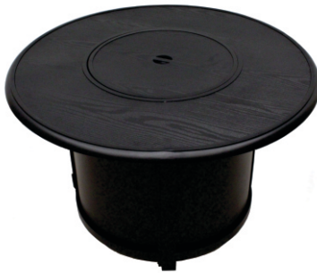
GI-FP352BK Round Firepit Size: 42" Dia. x 24.5" H